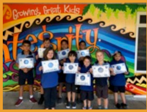
Recipients of this week's Mayfair Values Awards

Next Week's Focus Value: Use Manners and Show Kindness to Others RESPECT