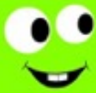
WHACKY HAIR / HAT DAY to raise funds for Child Cancer